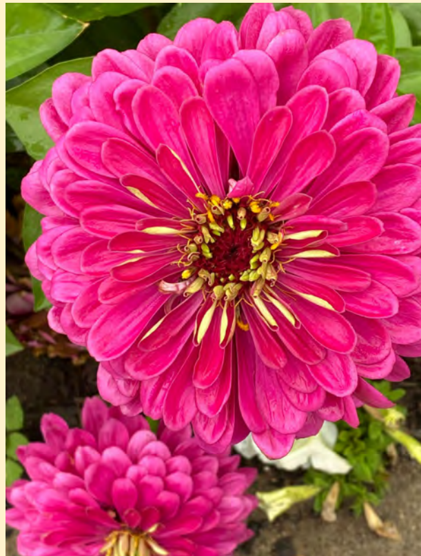
Zinnias in Iron Mountain