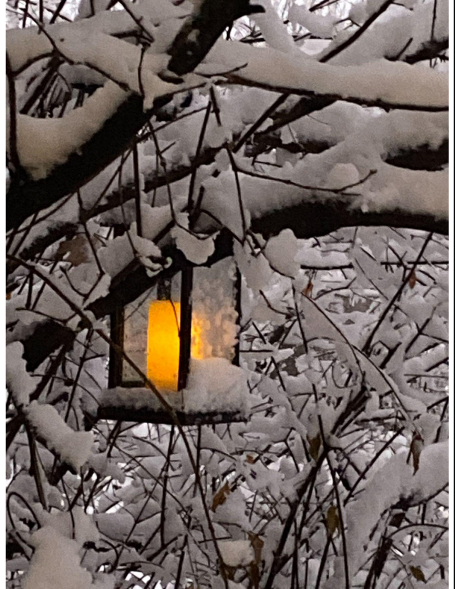
Snowy pics.