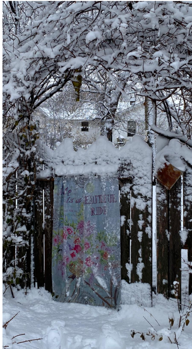
Fresh snow fall.