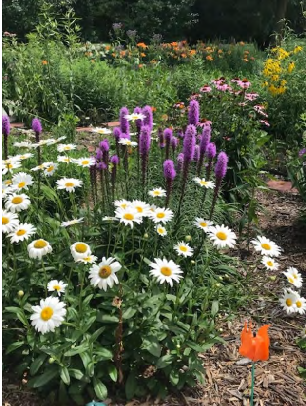
New butterfly area that is being developed.