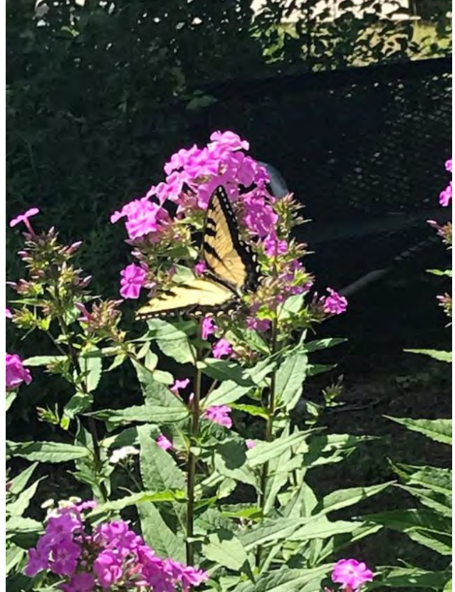
Eastern Tiger Swallowtail joining the group.