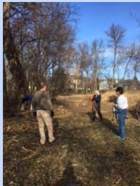
Oshkosh North Conservancy Park, Buckthorn Removal Day, Dec. 2, 50 degrees!

“To plant a garden is to believe in tomorrow.”