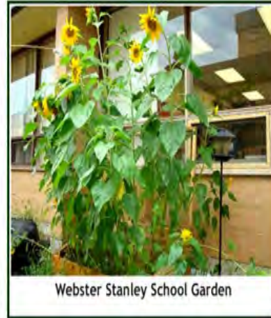
Webster Stanley School Garden

The Winnebago County Master Gardener Association meets monthly September through May on the second Tuesday of the month at 6:15 p.m. at the Coughlin Center, 625 E. County Road Y, Oshkosh. There is also an annual picnic in June and garden walks at member's homes in the summer months.