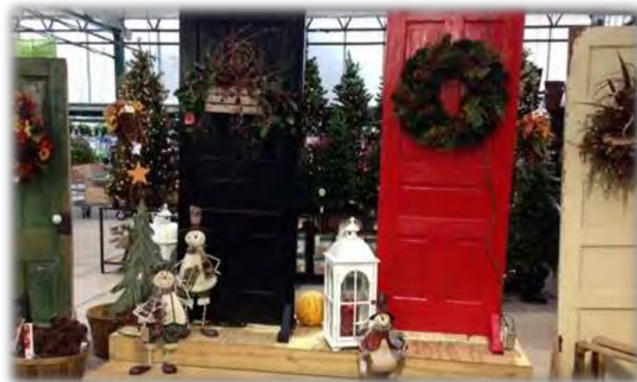
Caan Floral and Greenhouse

Mission Statement: Our purpose is to provide horticulture education, community service and environmental stewardship for our community in affiliation with the University of Wisconsin Extension Program.